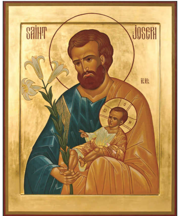
St Joseph Icon

Above tentative event dates are based on past year's experience and do not represent venue confirmations or firm calendar dates. They are just for organization and planning purposes.